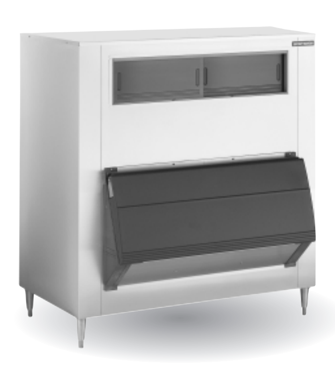
Bin includes 6" black enamel legs w/ adjustable leveling.